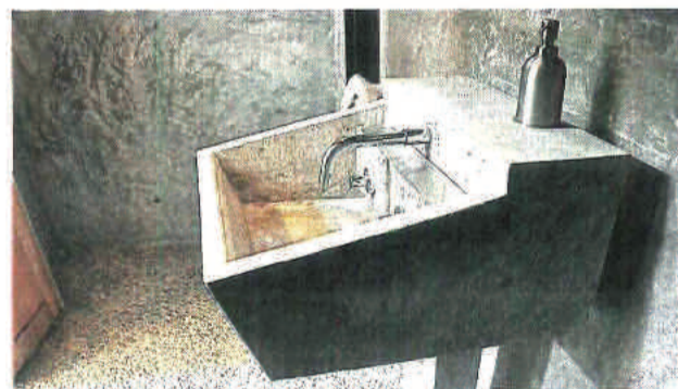
It is all in the details - even when you wash your hands at Tenggiri House