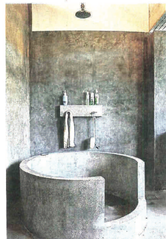
This re-interpretation of a bath and shower at Tenggiri House shows the creativity of Studio Bikin