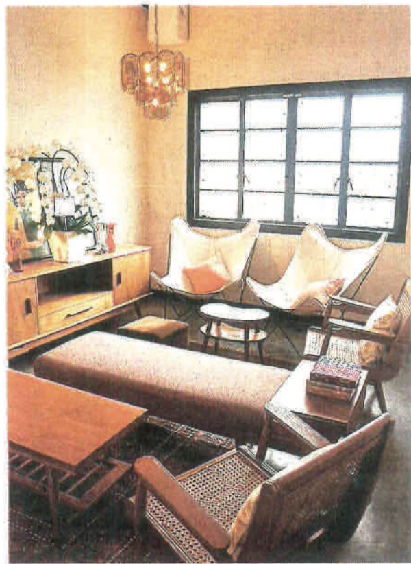
This home-like setting at Hit and Mrs changes the way people wine and dine