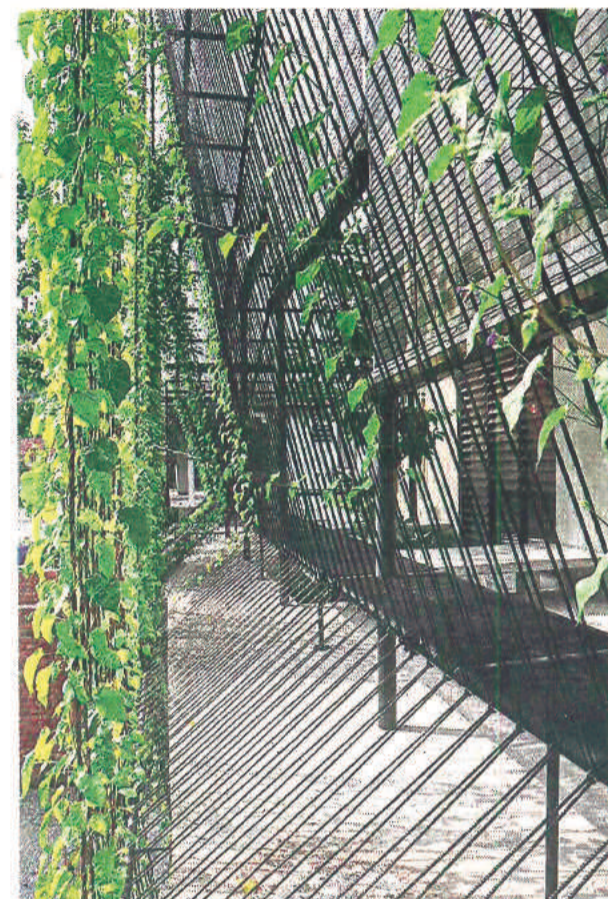
Tenggiri House is a private residential project Studio Bikin completed in 2010