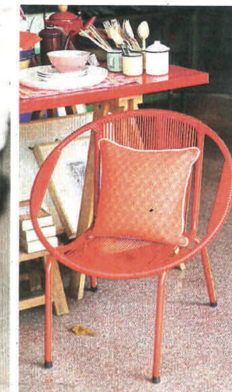
The pasar malam chair is Studio Bikin's homage to Malaysian artisans with upgraded specifications

Beauty is found in minute details, and it is as important as the big picture