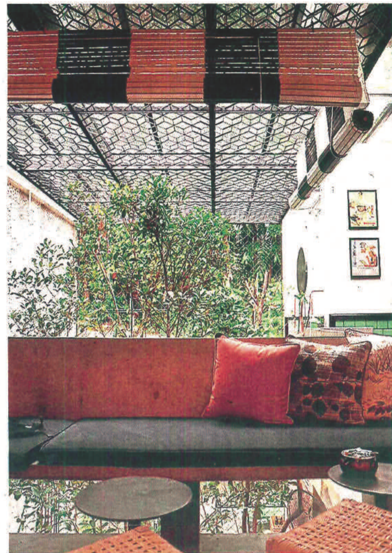
Hit and Mrs is also one of Studio Bikin's commercial projects