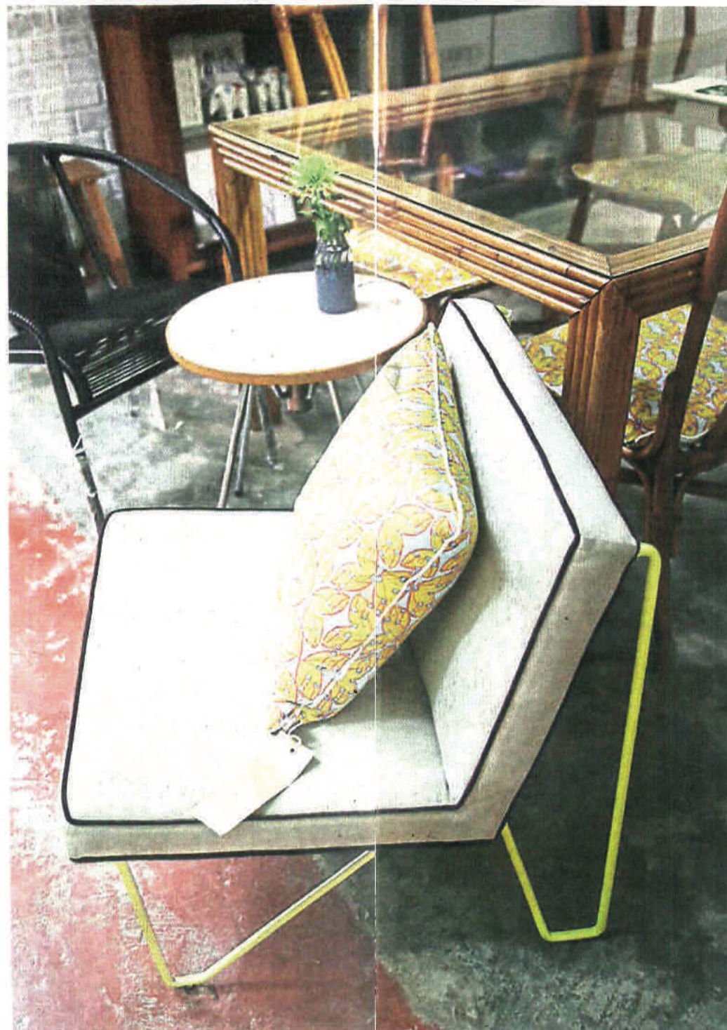
The symbiosis of Studio Bikin, Kedai Bikin and Nala Designs is seen here at DR.Inc