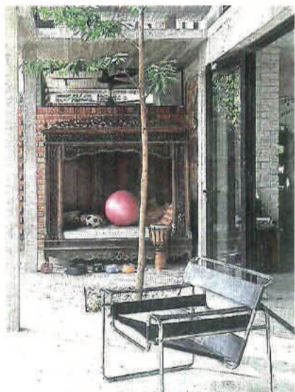
Tenggiri House by Studio Bikin is a private residential project that redefines modern living