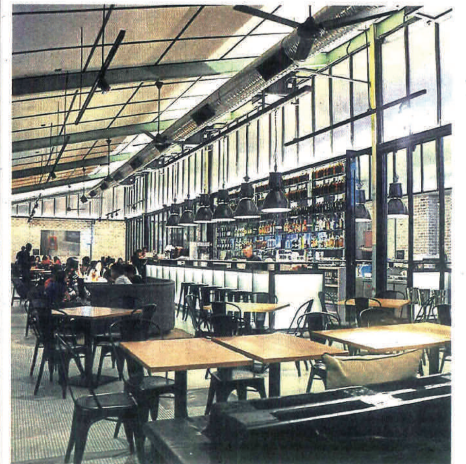
Plan B @ Kong Heng in Ipoh is architecturally constructed by Studio Bikin