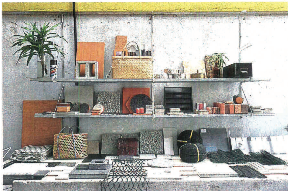
Studio Bikin's office at 8, Jalan Kemuja Bangsar displays tiles, fittings and more