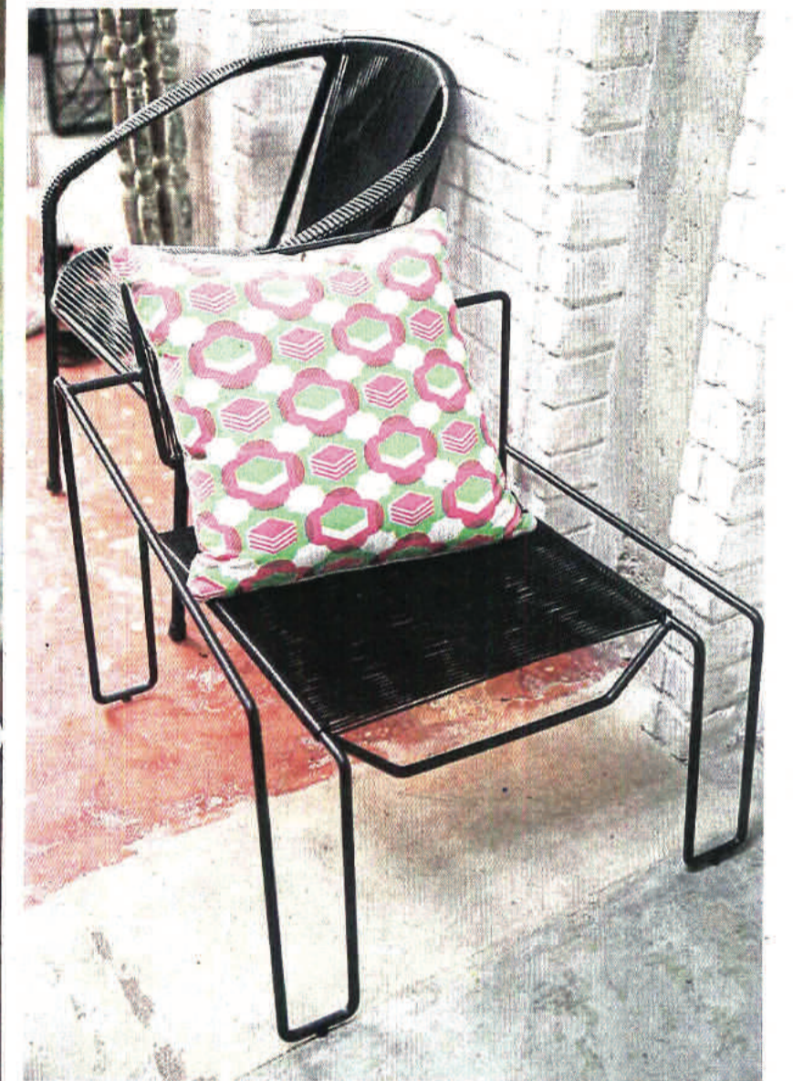
Kedai Bikin shows love for local artisans by creating chairs such as these